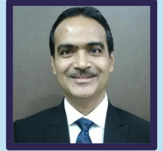
Shri. O. P. Gupta IAS

Hon'ble Minister of State Higher & Technical Education